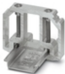
End clamp, for end support of UKH 50 to UKH 240, is pushed onto DIN rail NS 35 and fixed with 2 screws, width: 10 mm, color: aluminum

Marker for terminal blocks - KLM-A + ES/KLM 2-GB - 1004322